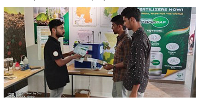
Brainstorming Session on Direct Seeded Rice (DSR)

presence of more than 250 participants underscored the significance of this program.